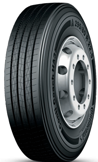
Conti Coach HA3 AC